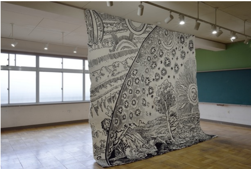
Yasuko WATANABE Dear outside , 2017

Inkjet print 2050mm x 3050mm (print size) 2000mm x 3000mm (image size) ed.2/2