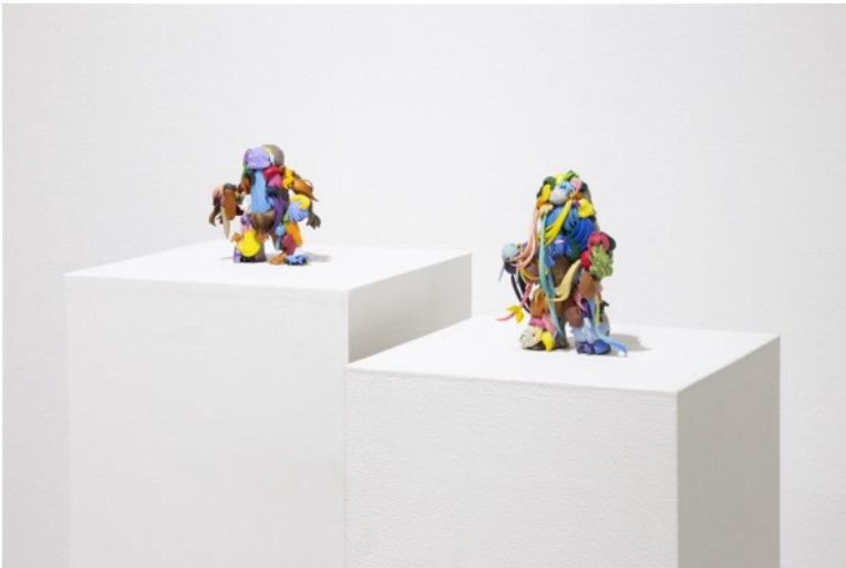
Teppei KANEUJI Teenage Fan Club #109, 2022

Plastic figures, hot melt glue 16.5x11x9cm Unique