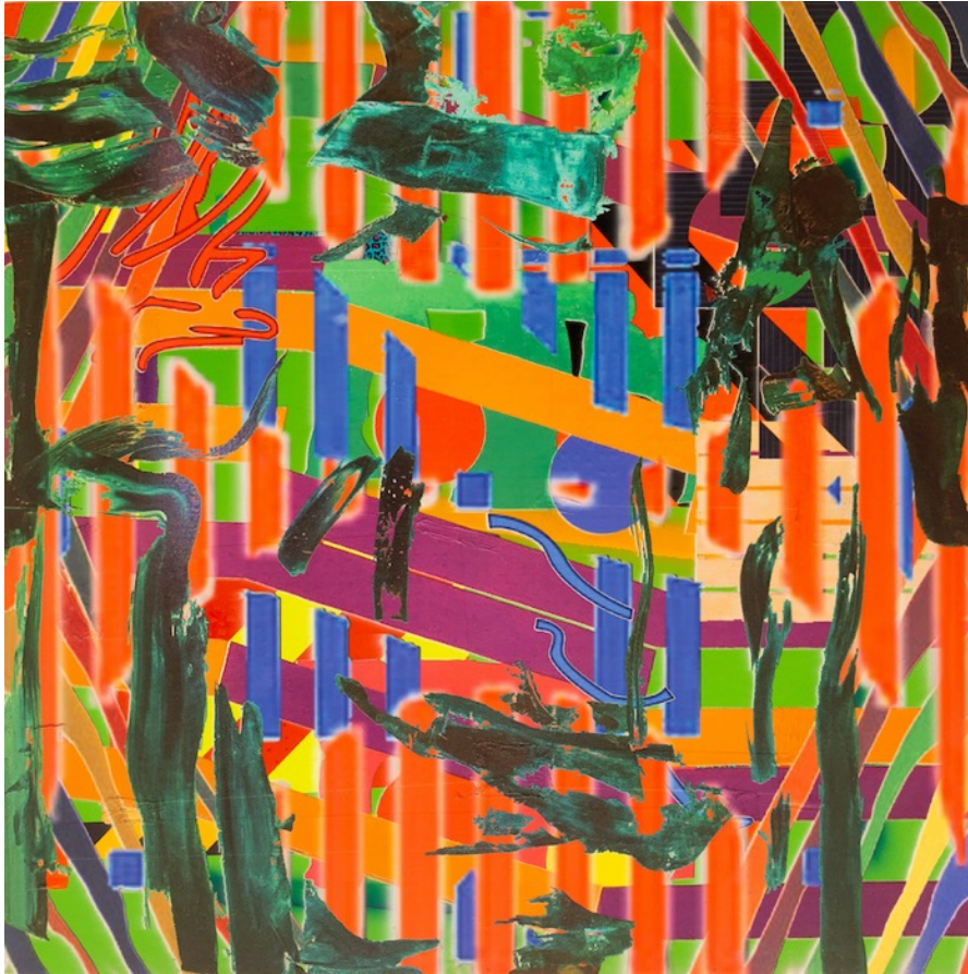
Teppei KANEUJI, POOOPOOO#15 , 2022