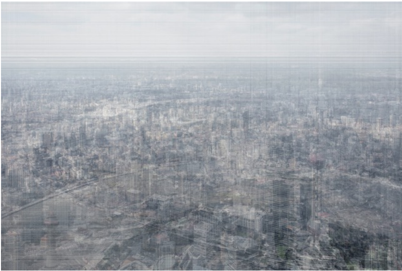
Kenryou GU Shanghai Tower , 2019

Inkjet print 2050mm x 3050mm (print size) 2000mm x 3000mm (image size) ed.2/2