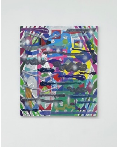
Teppei KANEUJI POOOPOOO#3, 2022