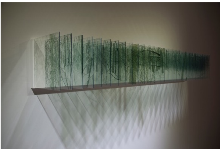
Nobuhiro NAKANISHI Layer Drawing - 28x28 / Snow, 2011

Plastic figures, hot melt glue 11.5x11x5cm Unique