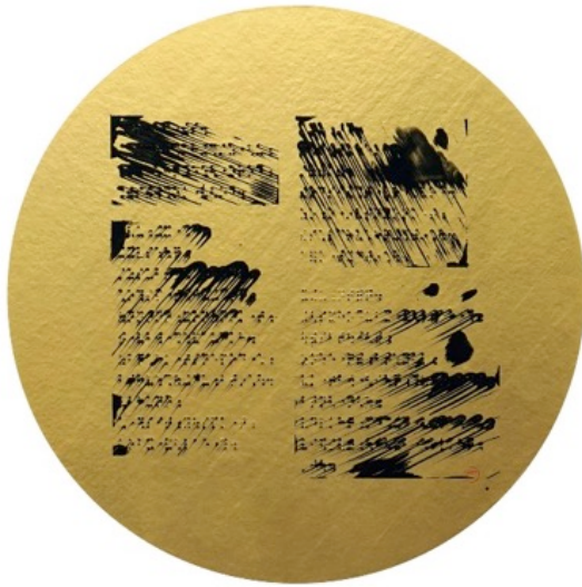
BRAILLE CODE - 枕草子(第一段) Makura no Soshi (Dai Ichi Dan)(The Pillow Book, Section 1), 2020 ©Gen Miyamura