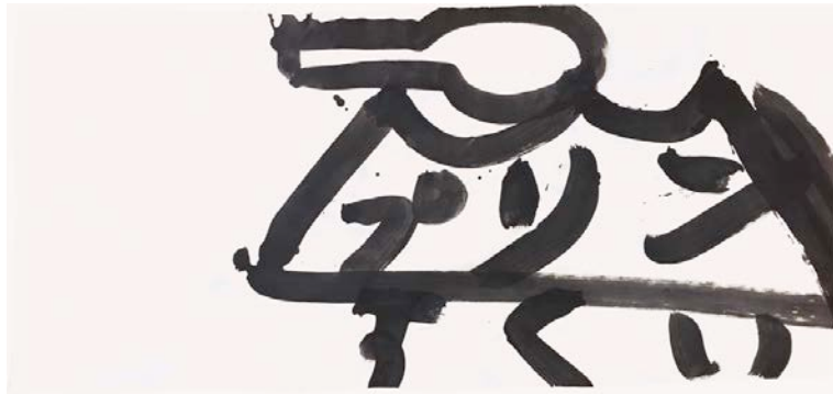
プリンすくい Purin sukui , (pudding scooping), 2019 ©Hisashi Yamamoto, Courtesy of Yumiko Chiba Associates