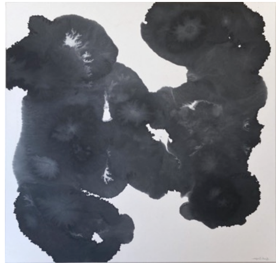
C.H4, 2019 ©Ayako Someya