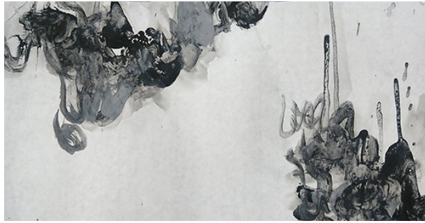
Gender~quota system~, 2020