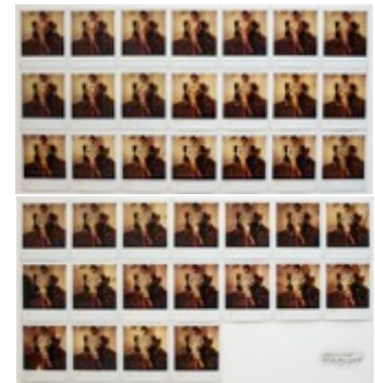
Shibafumi Maita

2016 Performing for the Camera, Tate Modern, London 2015 Re: play 1972/2015-Restaging "Expression in Film '72", The National Museum of Modern Art, Tokyo 2015 PROPORTIO, Palazzo Fortuny, Venice, Italy 2014 Image and Matter in Japanese Photography from the 1970s, Marianne Boesky Gallery, New York 2013 Gutai: Splendid Playground, Solomon R. Guggenheim Museum, New York 2012 Gutai: The Spirit of an Era, The National Art Center, Tokyo 2012 A Visual Essay on Gutai at 32 East 69 Street, Hauser & Wirth, New York 2011 Masked Portrait – When Vibrations Become Forms, Marianne Boesky Gallery, New York, USA 2007 Radical Communication: Japanese Video Art 1968-1988, The Getty Center, Los Angeles 1994 Japanese Art after 1945: Scream Against the Sky, Yokohama Museum of Art, Solomon R. Guggenheim Museum, New York, San Francisco Museum of Modern Art 1983 Photography in Contemporary Art, The National Museum of Modern Art, Tokyo; The National Museum of Modern Art, Kyoto 1982 4th Biennale of Sydney, New South Wales Institute of Technology, Sydney, Australia 1969 Fluorescent Chrysanthemum—Contemporary Japanese Art, ICA, London 1967 5th Biennale de Paris, Musée des Beaux-Arts de la Ville de Paris, Paris 1964 14th Gutai Art Exhibition, Takashimaya Department Store, Osaka