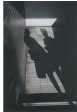
©Ryudai Takano. Courtesy of Yumiko Chiba Associates/Okinawa Museum of Contemporary Art