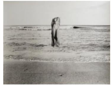
Shibafumi Maita

2013 Yokosuka Museum of Art, Kanagawa 2012 Minokamo City Museum of Art, Gifu 2006-2007 Iwate Museum of Art, Iwate 2004-2005 Minokamo City Museum of Art, Gifu 2003 Ohara Museum of Art, Okayama 1997 Nizayama Forest Art Museum, Toyama 1995 The Sapporo Museum of Sculpture, Sapporo 1985 Passages-Centre d'art Contemporain, Troyes, France 1983 Space, Los Angeles, U.S.A. ('89) 1972 Galerie Lambert, Paris, France 1966 Muramatsu Gallery, Tokyo ('71,'75,'79,'81,'83)