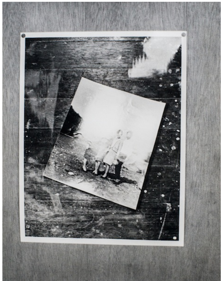
©The Estate of Jiro Takamatsu, Courtesy of Yumiko Chiba Associates